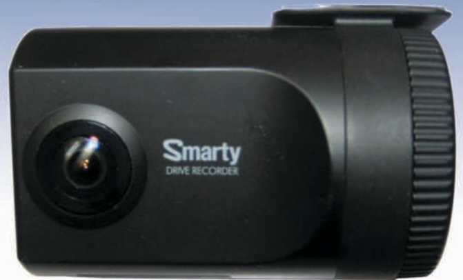
CAMERA SIDE FACING FRONT TO STREET

Two models: KEY-BX 1000 Video drive recorder with 2GB SD memory card, cable and software KEY-BX-1000 Plus Video drive recorder w/ 2GB SD card, cable, software and GPS