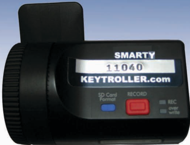
BACK SIDE FACING DRIVER